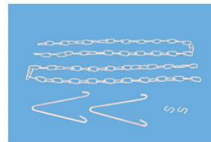
HF-2CV (2 foot) HF-3CV (3 foot) Hanging Chain & V-clips